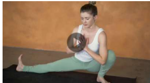
PRAISE ALWAYS | Creative Full Body Flow