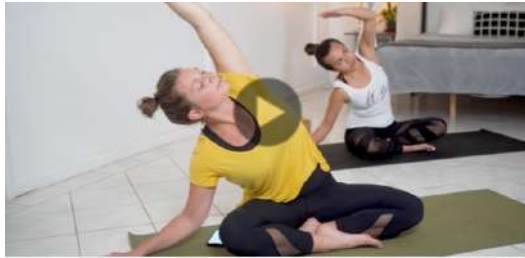
I AM SAFE | Hip & Heart Opening Moving Meditation