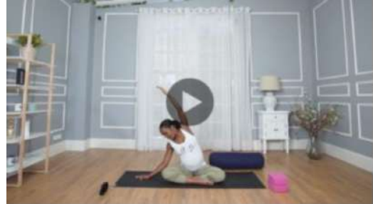
PERFECT PEACE | Prenatal Full Body Stretch