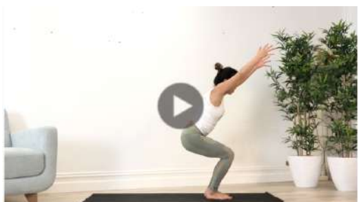
CALM THE STORM | Energetic Legs and Glutes